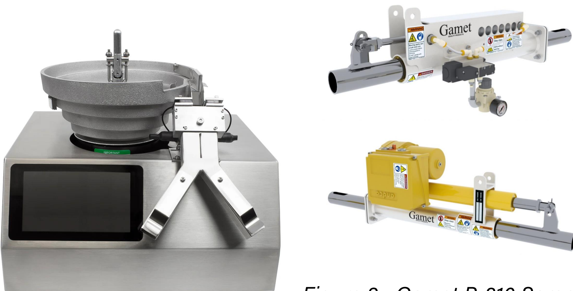
Figure 1: Seedburo 901

In industry many types of tabletop counters are used. While these counting machines are accurate, they require an operator to collect, sample, and run it through these machines. Companies like Seedburo and CGOLDENWALL produce these tabletop counters as shown in Figure 1, however they are costly and inefficient. For specialty crops in industry like oranges and tomatoes conveyors are used throughout processing facilities. Counters exist in on a much larger scale for these items.