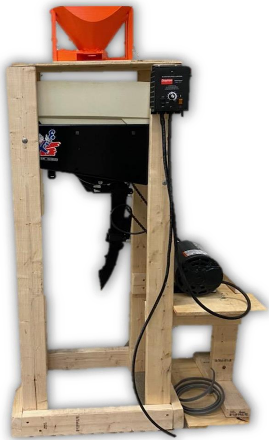
Figure 3: Prototyping and Testing of the Seed Counter

The final prototype is displayed in Figure 3. The frame consists of a Kinze frame, seed meter, and seed box. To power the meter, we used a Dayton 1/3 HP 3 phase motor with a VFD. To read, sense, and weigh the seed we used an Arduino, John Deere sensor, and load cells. A 3D printed hopper was used to hold the 1 lb of seed. The simple design proves a seed counter can be made inexpensive.